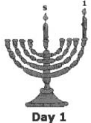
Place right to left; Kindle left to right.

On the second night, set the candles from right to left in the chanukiah. That is, beginning at the rightmost holder, put one candle, then put another candle in the holder to its left. Next, light the shamash , recite the Hebrew blessings, and then light the candles from left to right in the chanukiah (in other words, you begin lighting the newest candle first). Recite the Haneiroi Hallalu and then celebrate! This sequence continues night after night, until the eighth night, when the entire chanukiah is lit up: