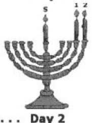
Note: If a day of Chanukah occurs on a Shabbat (i.e., Friday night), you