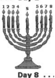
light the Chanukah candles before lighting the Shabbat candles